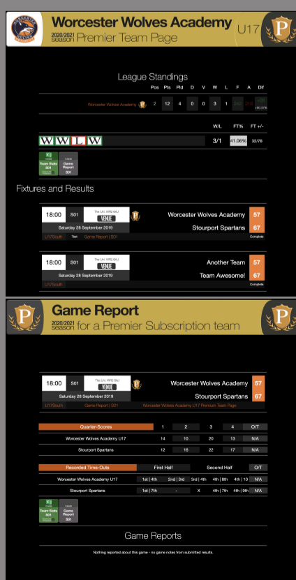
Example Web pages

Special YBL Licence Cards to denote teams Premier status